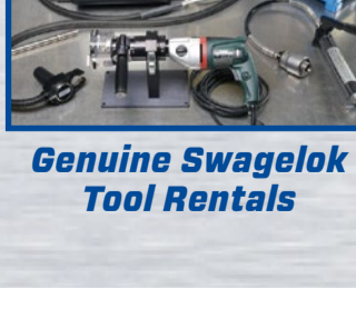
Genuine Swagelok Tool Rentals