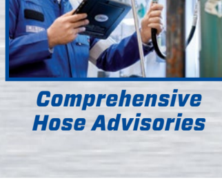
Comprehensive Hose Advisories