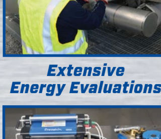
Extensive Energy Evaluations