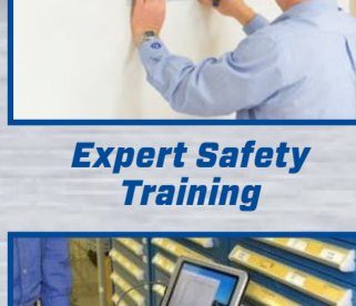
Expert Safety Training