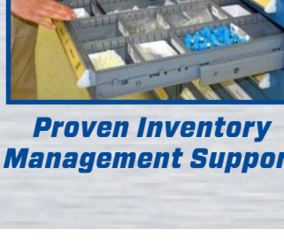
Proven Inventory Management Support