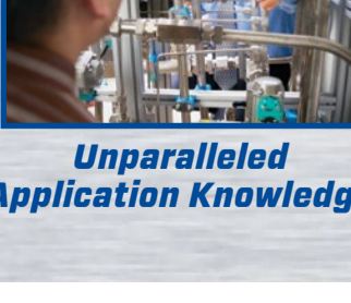
Unparalleled Application Knowledge