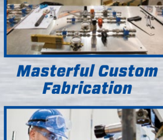
Masterful Custom Fabrication