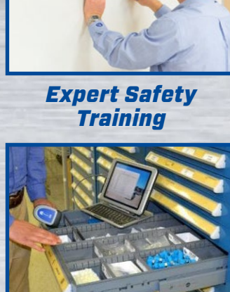
Expert Safety Training