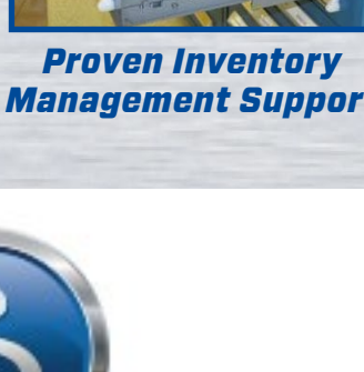
Proven Inventory Management Support