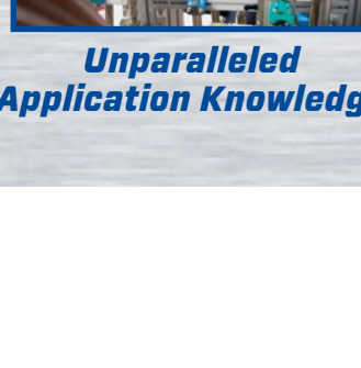
Unparalleled Application Knowledge