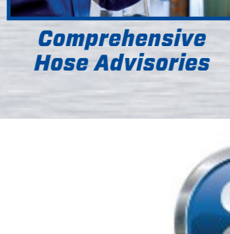
Comprehensive Hose Advisories