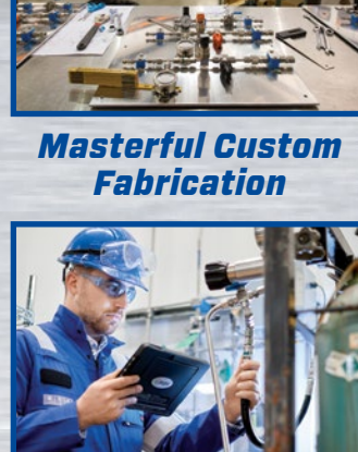
Masterful Custom Fabrication