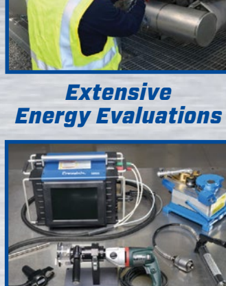
Extensive Energy Evaluations