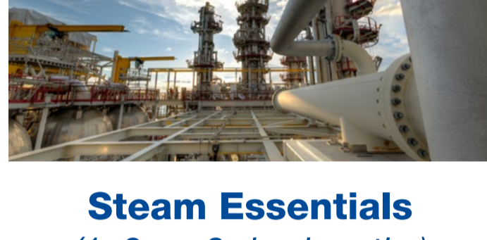
Steam Essentials (1, 2, or 3 day lengths)