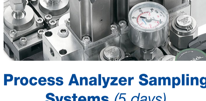
Process Analyzer Sampling Systems (5 days)