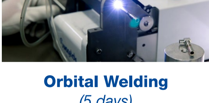
Orbital Welding (5 days)