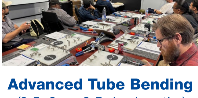
Advanced Tube Bending (2.5, 3, or 3.5 day lengths)