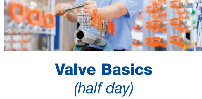
Valve Basics (half day)