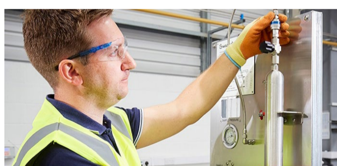
Analyzer Technician Essentials (2 days)