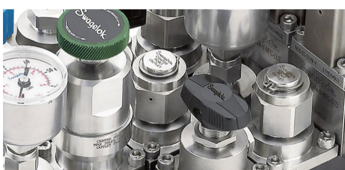
Sampling System Maintenance (2 days)