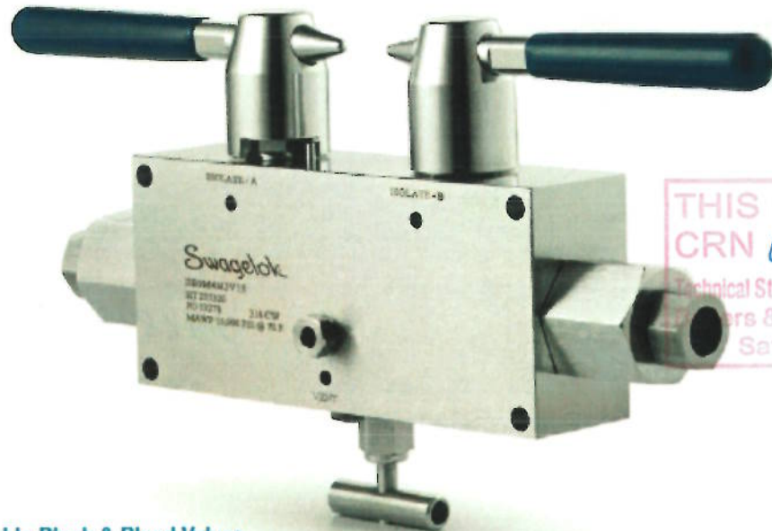
Double Block & Bleed Valves

THIS IS PART OF CRN 0C18171-5 Technical Standards & Safety Authority Pipes & Pressure Vessels Safety Program