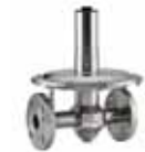
TBVS8 1 in.