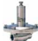
TBVS4 1/2 in. C v 0.32