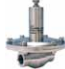
TBRS4 1/2 in. C v 0.32

Inlet and control pressures to 232 psig (16 bar) for select series