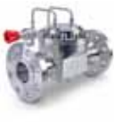
RD(H)F25, 30, 40 2 1/2, 3, and 4 in. C v 21, 36, 73