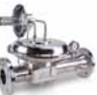
LPRD20, 25, 30, 40 2, 2 1/2, 3, and 4 in. C v 13, 21, 36, 73