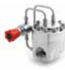
RD(H)15, 20 1 1/2 and 2 in. C v 7.3, 13