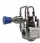
BD(H)15 1 1/2 in. C v 7.3