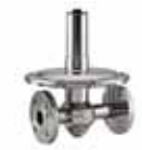
TBRS(H)8 1 in.