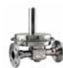
TBRS16 2 in.