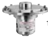
RA4, 6, 8 (Air Loaded) 1/2, 3/4, and 1 in. C v 1.95