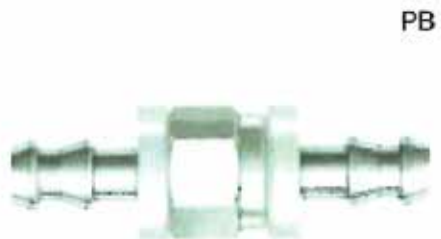
PB Union Adapter End Connection