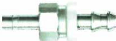
Tube Adapter End Connection