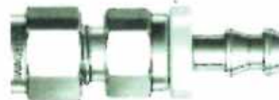
Swagelok Tube Fitting End Connection